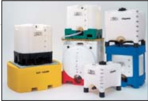
Transportation containers hold from 60 to 550 gallons.