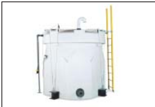
Captor Tank Systems available from 550 to 6,500 gallons.

For larger stationary applications, Snyder offers the industry's broadest range of tanks – from 8 to 16,500 gallons – in shapes that meet your specific needs. To match your special function requirements, we also market a complete line of accessories, such as stands, seismic tie-downs, ladders, fittings, gaskets, sight gauges, heat tracing and insulation.