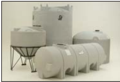
Stationary tanks store from 8 to 16,500 gallons.

Snyder intermediate bulk containers (IBCs) are durable, corrosion-resistant and economical. These long-term, reusable containers are ideal for the transportation of both hazardous and non-hazardous liquid materials.