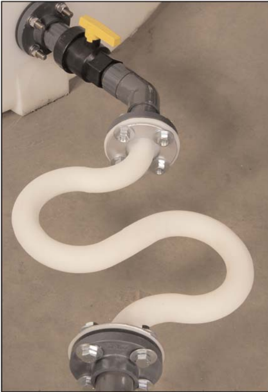
Flexible and Strong Enough to Handle the Job

In recent years, a variety of expansion joint products have been utilized to help alleviate the stress generated at the tank and piping interface points. While some of these products can be an expensive alternative in steel tank installations, none provide the degree of expansion required in a plastic tank, which is why Snyder engineering has been compelled to develop a solution to this age-old problem.